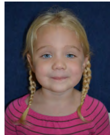
Cali Featherer Pre 3 & 4